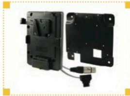
PBK17-S/A Pro Battery Kit $149.00