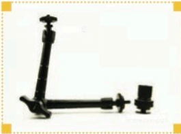
MA210 10" Monitor Arm $99.95