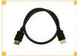
CAHDMI-1.6 1.6' HDMI Cable $24.95