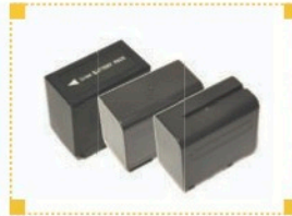
IBS970/IBC 950G/IBP D54 DV Battery $69.95