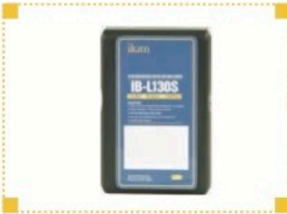
IB-L130S/A Pro Battery $375.00