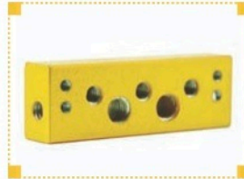
CHES-JR Cheese Stick Jr. $49.95